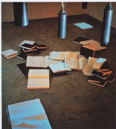
I Believe It Is an Image in Light of the Other, 1991-1992. Collection Stedelijk Van Abbemuseum, Eindhoven

retical. In the darkened spaces of his installations, we encounter language as part of a poetic enquiry.