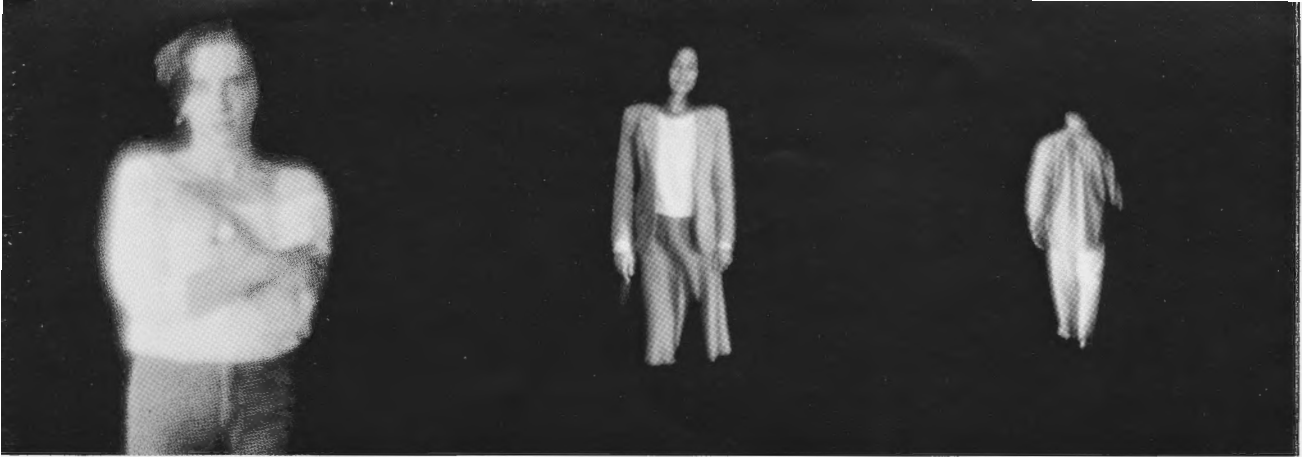
Details from Tall Ships , 1992. Collection Lannan Foundation, Los Angeles